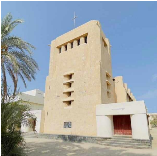
Christ Church Cathedral Port Sudan