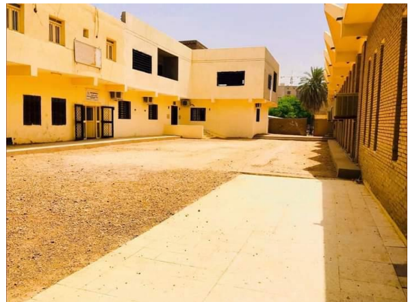
Khartoum Provincial Office + Beit al Salam