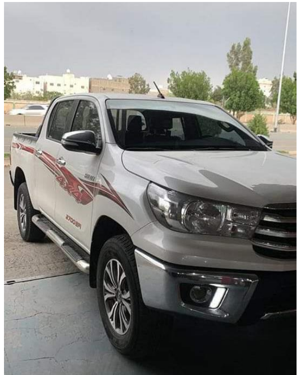
The New Car