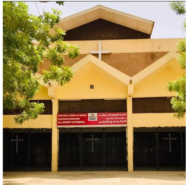
All Saints Cathedral Khartoum