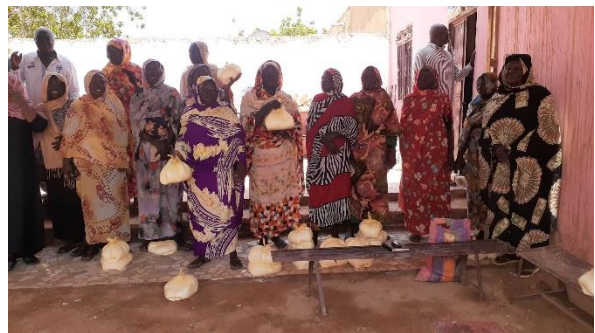
Relief Distribution at St Yaggub, Khuteir