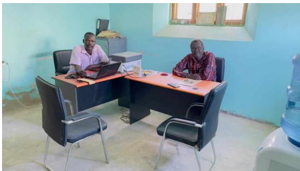
Provincial Secretary & Accountant