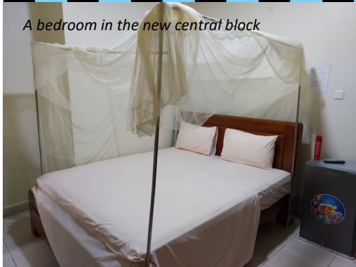
A bedroom in the new central block