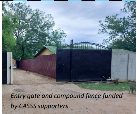
Entry gate and compound fence funded by CASSS supporters

of the facility attracts many customers and has created high demand for accommodation and meeting space. With All Saints' Cathedral next door, this is such a great place for Christians and others to stay whilst visiting or passing through Juba.